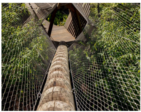
Suspended log bridges