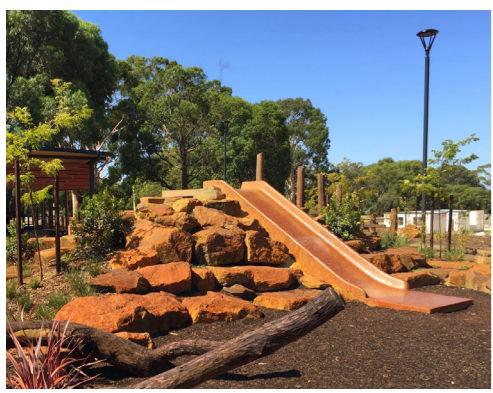
Rock clambering mound with slide

Note - Section of pathways to be resolved in the next stage of concept design to comply with accessibility standards