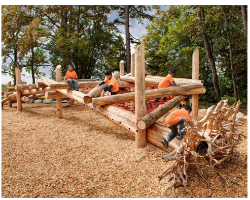
Log balancing and climbing